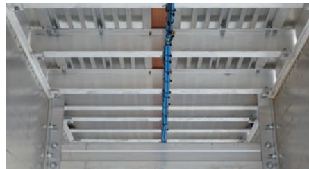
60,000 lb capacity coil package